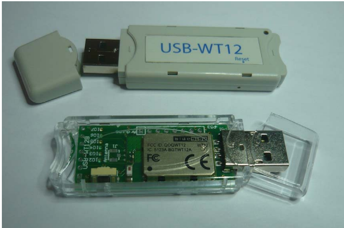
Figure 1 - USB-WT12 device